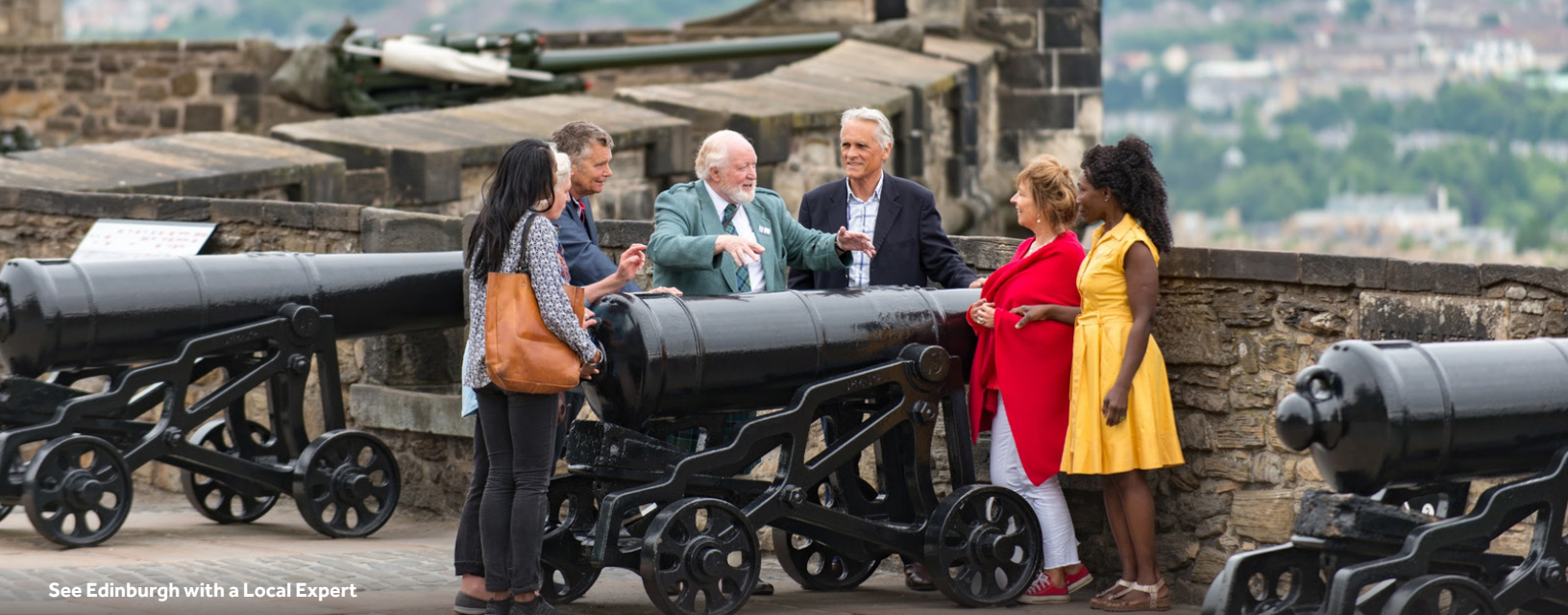
See Edinburgh with a Local Expert

The Highlands really is the Scotland of your imagination. Think big skies, mind-blowing landscapes, superb food and hospitable people - and you've got the Scottish Highlands. There's a natural playground which begs to be explored, while the region's turbulent history has left behind some of the most beautiful and romantic castles in the world. Source: Visit Scotland - From the great capital of Edinburgh to the Orkney Islands and Skye, you'll travel through 8,000 years of history and become immersed in Scotland's rich cultural heritage.