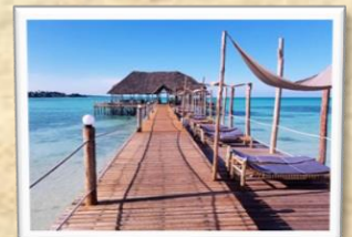
Zanzibar Beach Resort