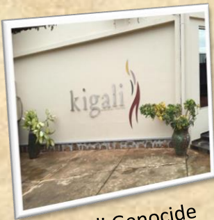
Kigali Genocide Memorial